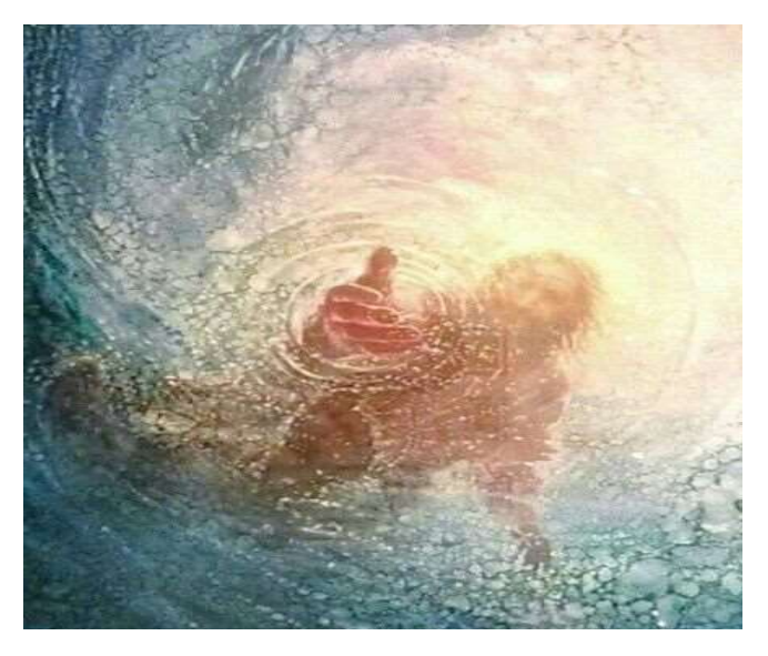
The Lord says: "I will never let go of your hand..."

May the blessing of God the Holy Spirit be upon us as we listen to His promptings and take obedient risks as He leads us